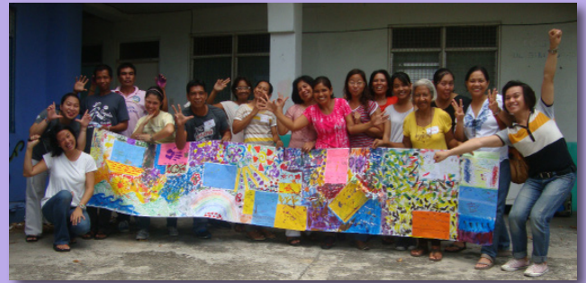
Above: Training staff and participants pose with the symbolic mural they collectively created at the end of the workshop

Our sincerest thanks to all who contributed to our relief, recovery & rebuilding efforts for those affected by Super Typhoon Yolanda: