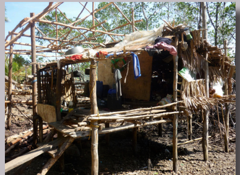
One of the homes being rebuilt by Tagbanua families in Sitio Alulad, Culion, where structures were severely damaged

In response to the immensity of the need from calamities that affected the nation in the Year 2013 such as Super Typhoon Yolanda (internationally known as Haiyan ), Cartwheel—fueled by the outpouring of help from its supporters within the country and overseas—mobilized relief and rehabilitation efforts for communities that need it the most, as in the figures to the left.